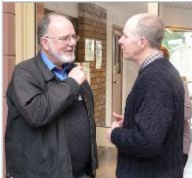
Below & left: Diocesan Ministry Conference