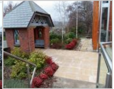
Above: St Aidan's completed paving works