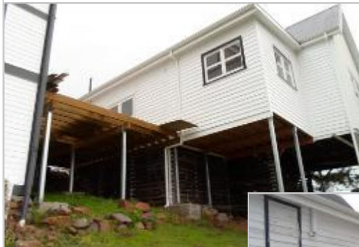
Above & right: St Oswald's redevelopment in progress